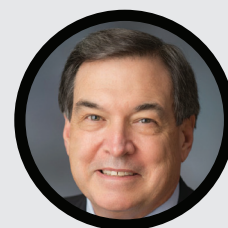
Jon Wellinchoff Former Chairman Federal Energy Regulatory Commission (FERC)

"We need a robust dialogue about what needs to be done, to ensure that we're moving forward in a very positive direction to protect these critical assets that have such an essential part to play in our overall economic infrastructure in this country. Ultimately, we want to protect this country, we want to protect the grid, but we want to also do it in the most cost-effective way possible."