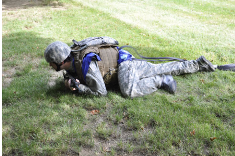
Soldier crawling wearing vest, body armor and blue sensor pads

Credit Given to Partnership of New Sensor Technology and Human Factors Engineering