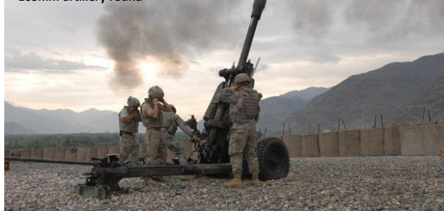
US Army testing a new 105mm artillery round